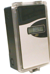
aSENSE® Alarm (wall mount IP 54)

aSENSE® - Alarm is available for installation on the wall or in a ventilation duct. It is a very flexible alarm unit with programmable outputs for linear control of fans or peripheral alarm equipment.