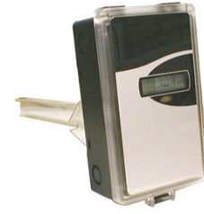
aSENSE® Alarm-K (duct mount IP 65)